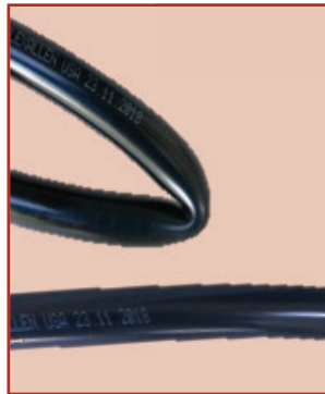
This is the same tube - kinked, then recovered less than 5 seconds later