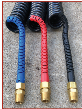
Grips are available in 3 colors - blue, red & black. Black allows for universal applications.